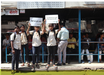
Pic 2: School students holding the demand signs at MaNaPa bus depot.