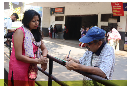
Pic 4: Demand card being signed by an elderly gentleman at Deccan bus depot.