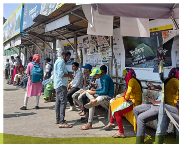
Pic 6: Volunteers explained the issue to Pravasi at Swargate depot.