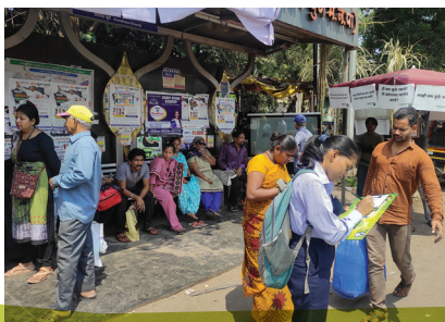
Pic 5: People waiting longer than one hour sharing the issue and signing the demand card at Kondhwa bus stop.