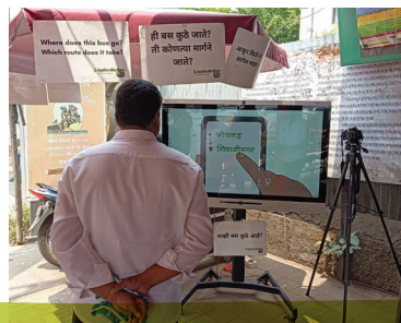
Pic 3: Bus app Installation at Kothrud bus stop.