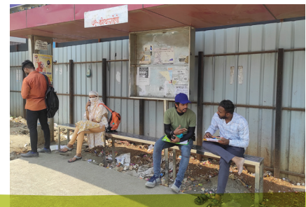
Pic 7: People were eager to know how to deal with low-frequency issues and save their time at Bibwewadi depot.